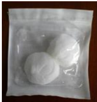
Photo 1 --Sterile Gauze Balls