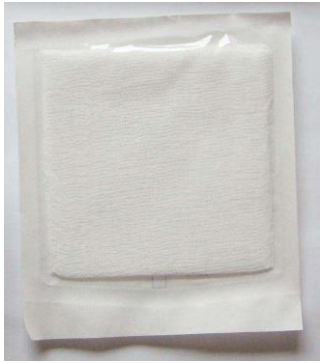
Photo 1 --- Gauze Sponges in sterile packaging